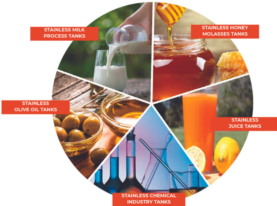
STAINLESS MILK PROCESS TANKS